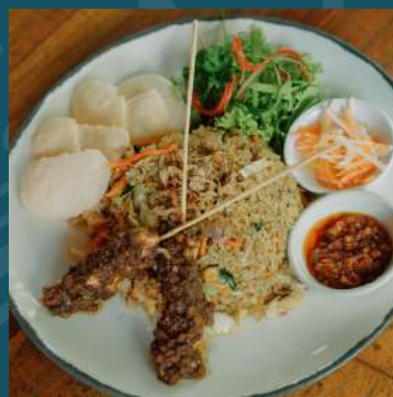
Nasi Goreng Chicken