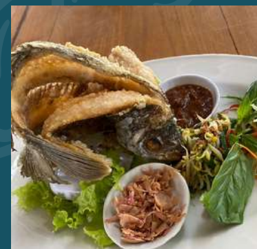
Gurame Kemangi / Flying Gurame