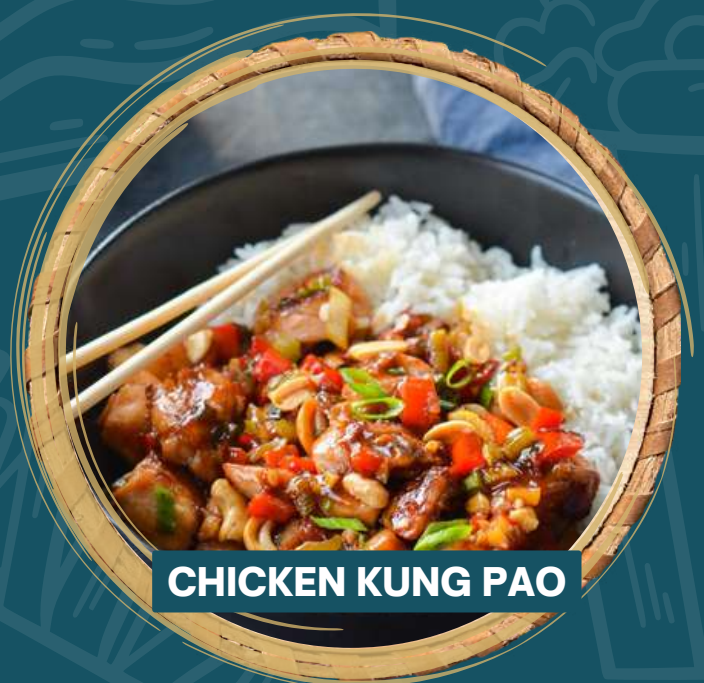
CHICKEN KUNG PAO